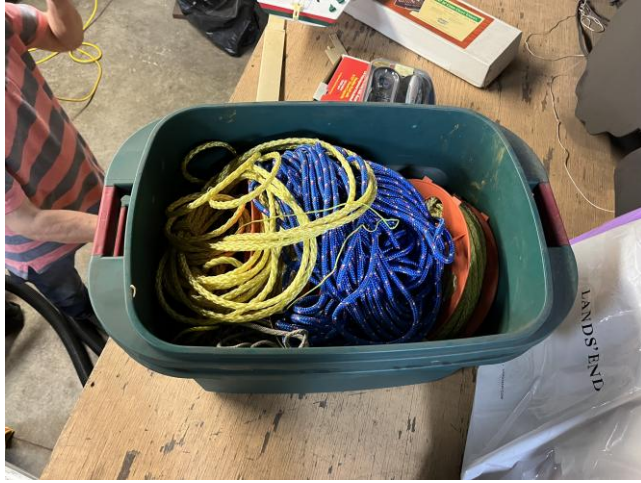
Plastic storage container with gorgeous assorted new appearing rope