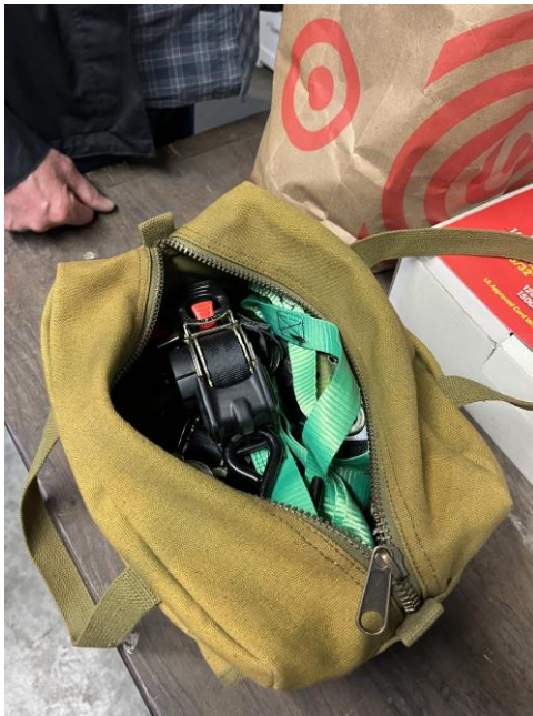
A small bag of premium tie down ratchet straps

Let me know if you have knowledge of the use/purpose of these items.