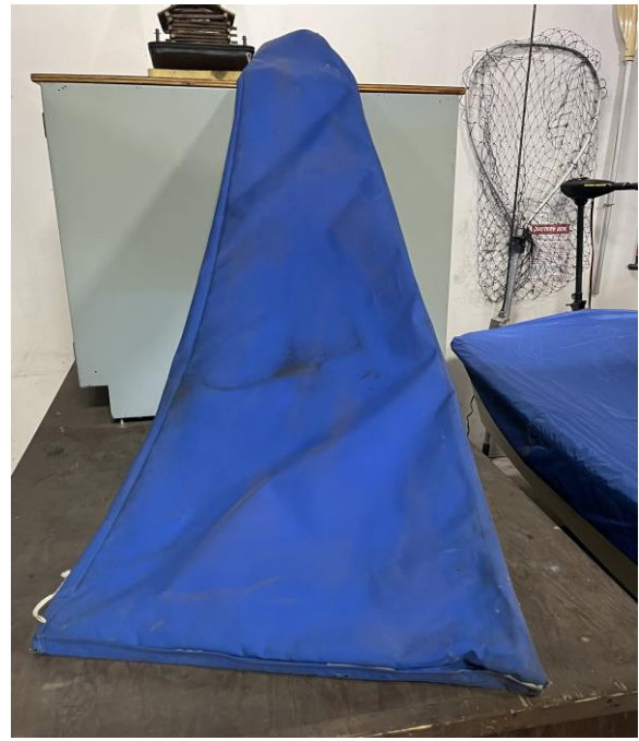
Appears to be a sail locker, not sure when or how it came to be in the cage