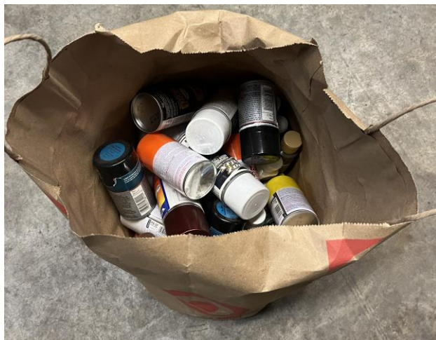
Assorted spray paints.

Starting with the incomplete pirate boat in the back and clockwise: Pirate Boat; Chris Craft Utility kit; two “Lighted Table Accent” boats - I think we could use these as drawing giveaways at the parade; PVC tube sealed at both ends labeled “EMYC Burgee + Flagpole Key”; air compressor for painting; cold solder tool; cabin cruiser with motor and nothing else; Flex shaft tool.