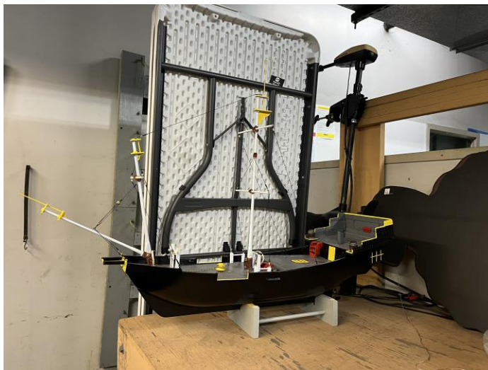
The previously mentioned pirate conversion boat, just to let you know it is in the cage if you want to take a look at it.