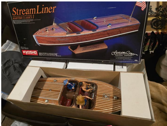
Todd Formico has this boat on Facebook. Let me know if you are interested and I will put you in touch with him.