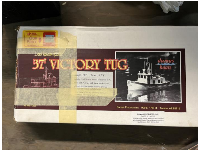
The Victory Tug kit box.